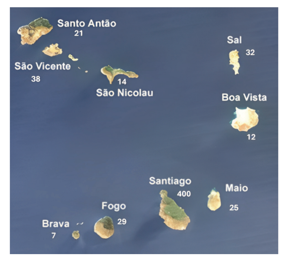
Figure 1. Number of cases per Island. In five cases, the origin was unknown and three were immigrants.