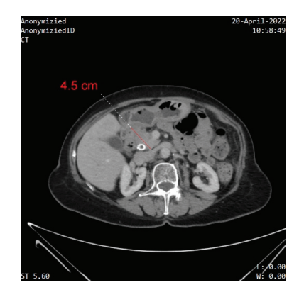
Figure 2. Contrast-enhanced CT demonstrating the stability of the mass at the head of the pancreas without further progression, or distant metastases.

Chemotherapy was commenced with modified FOLFIRINOX (leucovorin/5-FU/irinotecan/oxaliplatin). The first cycle was uneventful, but the second cycle was complicated by hospital admission for the management of diarrhoea, dehydration and urosepsis. The patient refused any further intravenous chemotherapy. She was willing, however, to try other oral options.