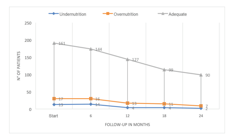
Figure 2. Nutritional status at diagnosis, and 6-month follow-up.