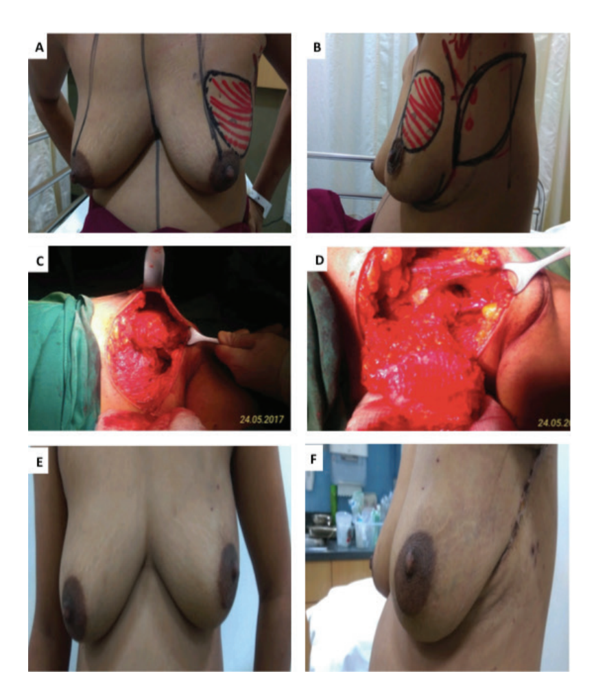
Figure 1. A.B. Preoperative marking and localization of perforators for LICAP; C,D. The tumour was excised and the flap was completely isolated on one lateral perforators; E, F. Post operative pictures