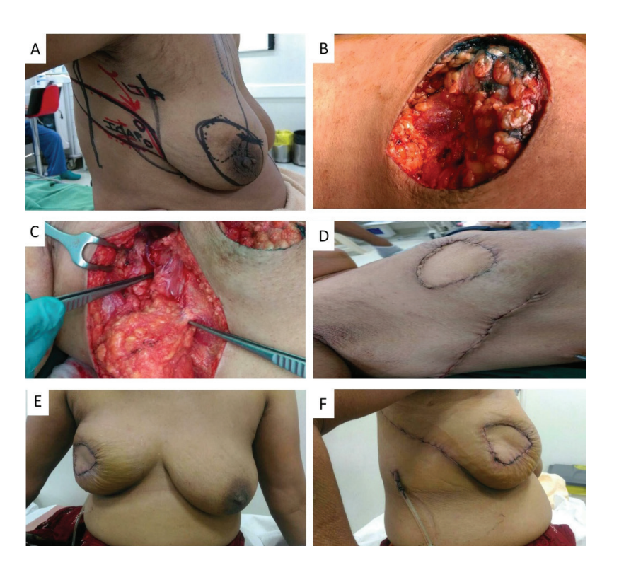
Figure 3. A. Preoperative marking and localization of perfortors for combined LTAP plus ICAP; B. Defect after tumour excision; C. The flap was completely isolated on the perforators; D: Immediate post op pictures; E, F. On follow up. Patient was not ready for contralateral symmetrisarion.

Intraoperative assessment of the surgical margin status using frozen section is an option which is used in some centres. However, the frozen section is time-consuming and does not guarantee complete excision of the tumour, and there is always the possibility of having positive margins reported on the final histopathological report. In a study by Munhoz et al [16], 218 patients underwent BCS with reconstruction and had frozen section to confirm excision margins, but final histopathology reports showed positive margins in 5.5% of these patients in spite of a previously negative margin reported on the frozen section. In our institution, the frozen section is not used routinely for margin assessment although it is available for use if required. In this series, the frozen section was not requested for any of the patients.