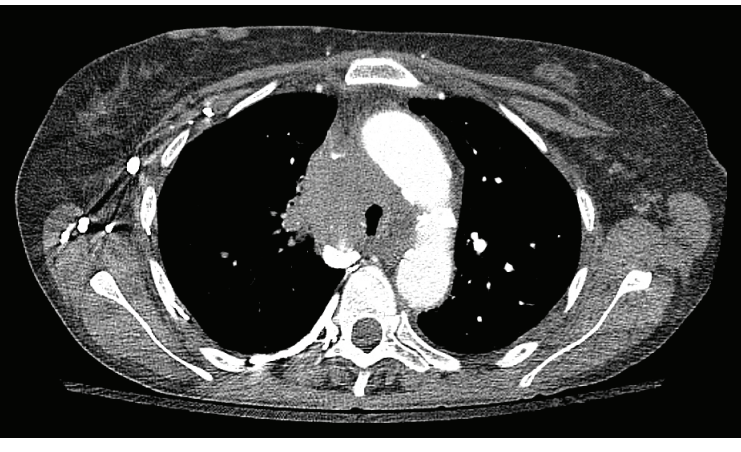
Figure 2a and b: a) CT thorax demonstrating tracheal compression at the level of the tumor b) Lateral view showing the large mediastinal NSCLC with compression of the right mainstem bronchus.

A chest radiograph showed an elevated right hemi-diaphragm, mediastinal lymphadenopathy, as well as tracheal compression near the level of the carina (Figure 1). CT scan of chest showed a mediastinal mass completely encasing the patient's superior vena cava (Figure 2a and b). The mass was causing significant narrowing of her trachea and right mainstem bronchus. The scan also revealed three right upper lobe lesions and a 2.6-cm mass in her left adrenal gland concerning for metastasis. MRI of the brain performed for staging showed no evidence of metastatic disease.