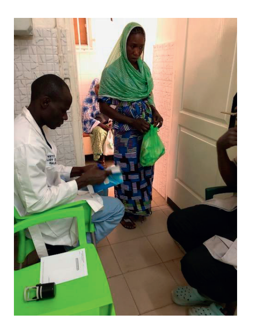
Figure 4. A patient presenting at her chemotherapy appointment with her medications.