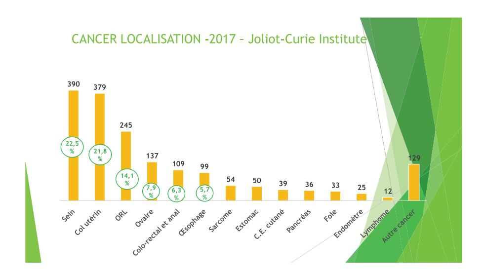
Figure 1. Cancer localisation, Cancer Institute tumour registry, 2017 (unpublished data).

The Human Resources Development strategic axis of the 2016–2020 National Strategic Plan for the Fight Against Cancer has planned to have 50% of doctors and general surgeons follow seminars and practical internships for chemotherapy training, in order to achieve a 30% 5-year survival rate for treated cancer patients. There is also an annual offer of three fellowships for full specialisation in medical oncology.