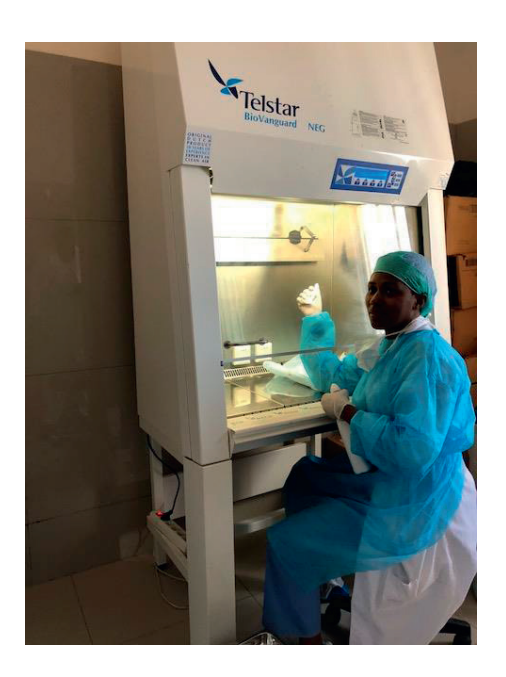
Figure 5. A single hood for the preparation of anticancer drugs.

A grant of 1.5 million euros per year was recently announced by the government on the basis of a technical and financial proposal which will be renewed every year.