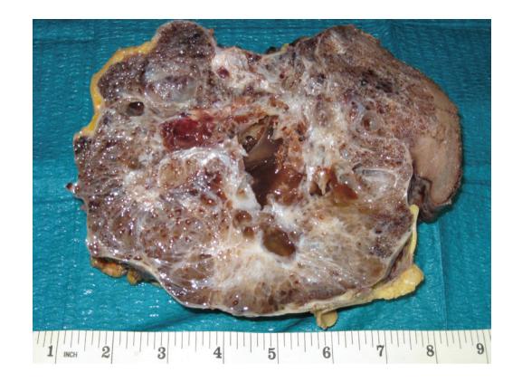
Figure 1. The cut surface of the spleen showed a large mass with numerous macrocystic and microcystic spaces filled by gelatinous or haemorrhagic fluid.