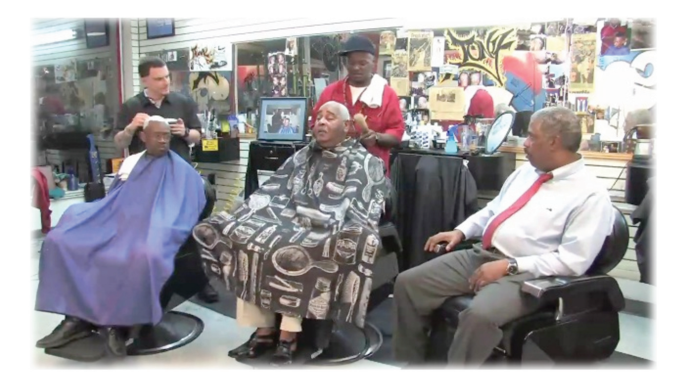
Figure 2. W.O.R.D. Video Scene.