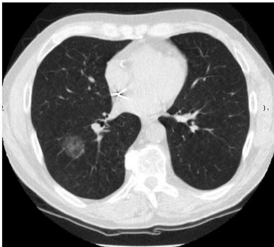
Figure 4: This is a non-small-cell lung cancer.

They are most difficult to interpret for radiologists [3].