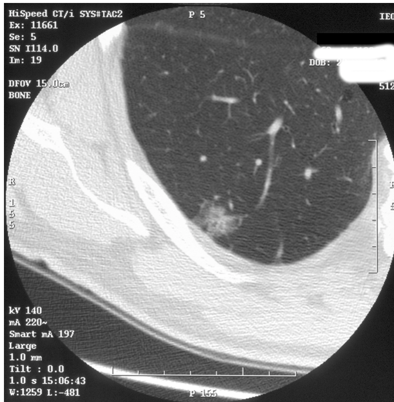
Figure 3: A semisolid nodule in the lower right lobe. This is an adenocarcinoma with a bronchioloalveolar component.

This is a semisolid nodule consisting of both ground-glass and solid soft-tissue attenuation components. It partially obscures the surrounding parenchyma.