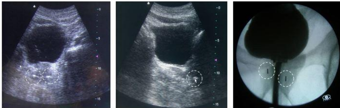
Figure 2: US and x-ray images of the CyberMark™ markers (dotted circles) in the brachytherapy patient.

Each marker was implanted via a transperineal percutaneous approach, using a dedicated preloaded needle under real-time transrectal US guidance.