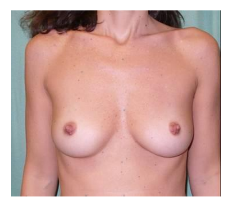
Figure 1: A 37-year-old patient before bilateral NASM (preoperative view)