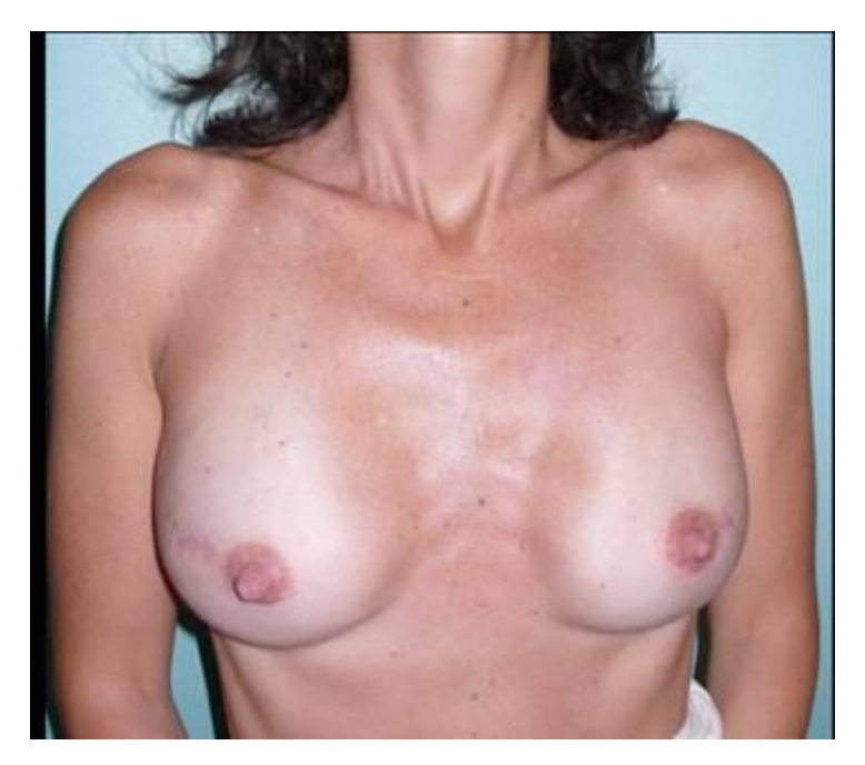
Figure 2: Post-operative view after bilateral NASM and immediate reconstruction with a bilateral 450 cc tissue expander