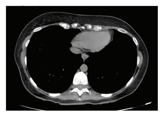
Figure 6. Computed axial tomography analysis after resection of secondary haematogenic implant.

A study involving 139 patients found that complete surgical resection without microscopic residual tumour and contamination is likely to offer the best chance of long-term survival. Aggressive surgery for recurrent sarcoma is recommended [10].