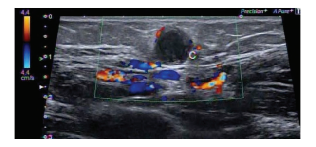
Figure 3. Ovoid hypoechoic nodule, located in the lateral quadrant of the right breast. Category BI—RADS 3.

Retroperitoneal and intra-abdominal leiomyosarcoma, the most common subgroup, is associated with an aggressive clinical course. In contrast, leiomyosarcoma of the somatic soft tissues represent the second subgroup and has a better prognosis. Primary cutaneous leiomyosarcoma comprises the third subgroup and arises from the piloerector muscle of the dermis. These lesions present as pyogenic granuloma, basal cell carcinoma, squamous cell carcinoma, fibroids and node injury. Multiple lesions of cutaneous leiomyosarcoma should raise the possibility of abdominal or retroperitoneal metastatic disease [7].