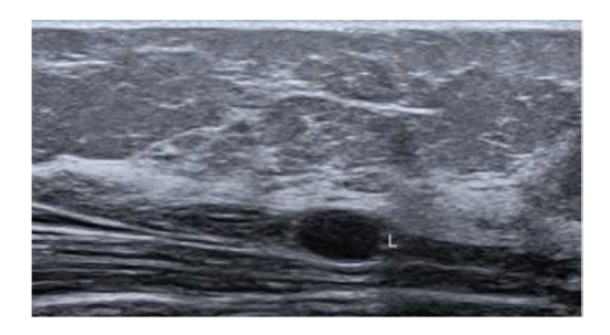
Figure 2. Ultrasonography showing subcutaneous fluid collection in the anterior aspect of the left arm root.