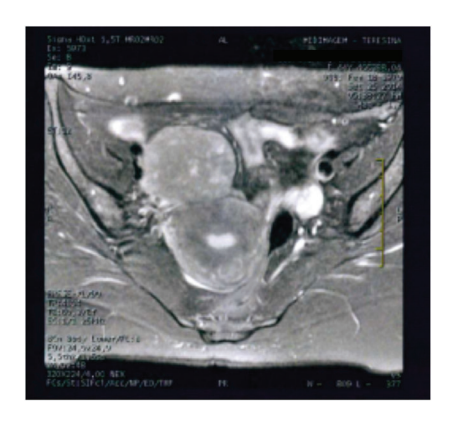
Figure 1. Axial T2-weighted MRI image showing a solid expansile lesion.