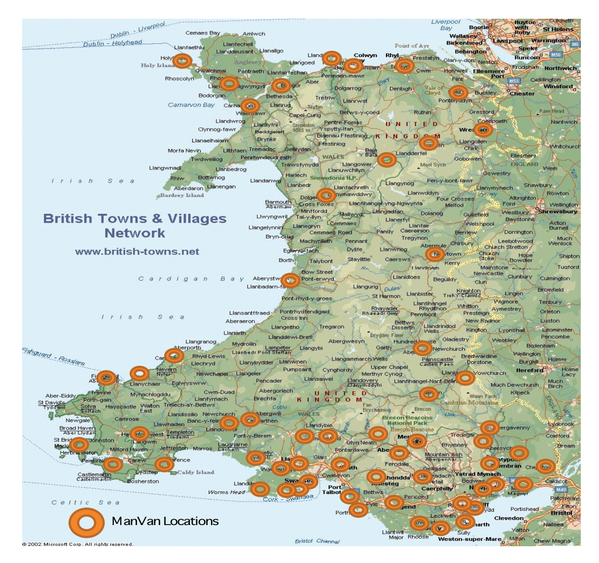
Figure 1. Map of Wales with locations visited.