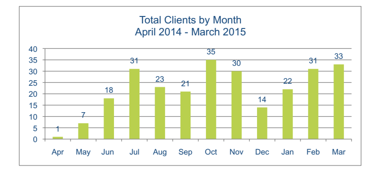
Figure 2. Total ManVan clients per month, 2014–2015.