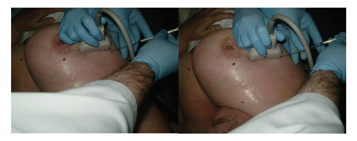
Figure 2. SNOLL technique, ultrasonographic guidance.