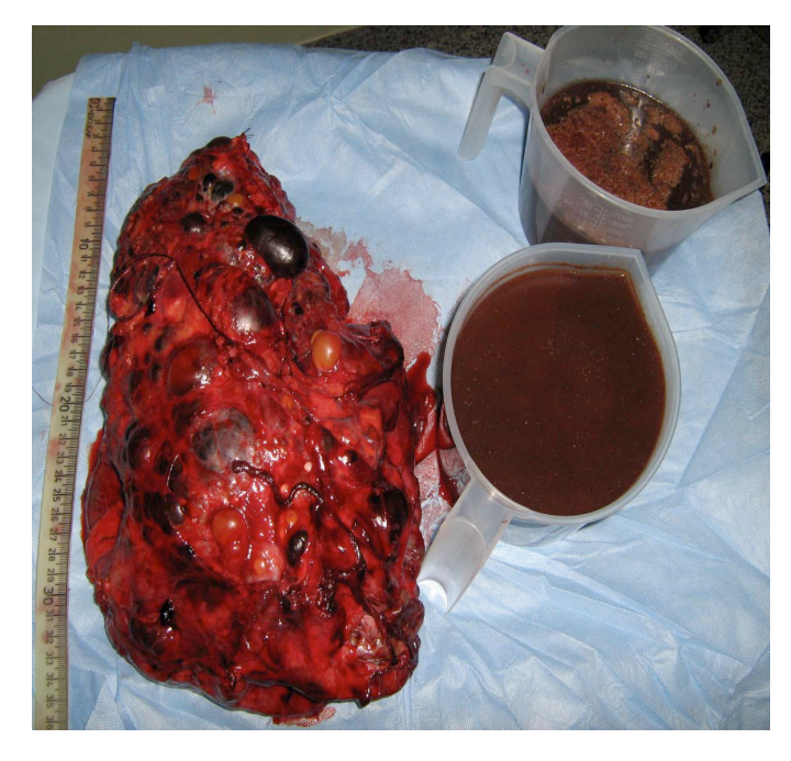
Figure 2: Left nephrectomy specimen weighing 3.5 kg along with 1,800 ml of aspirated fluid.