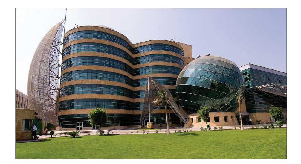
Figure 2. Children's Cancer Hospital Egypt - 57357 (CCHE).