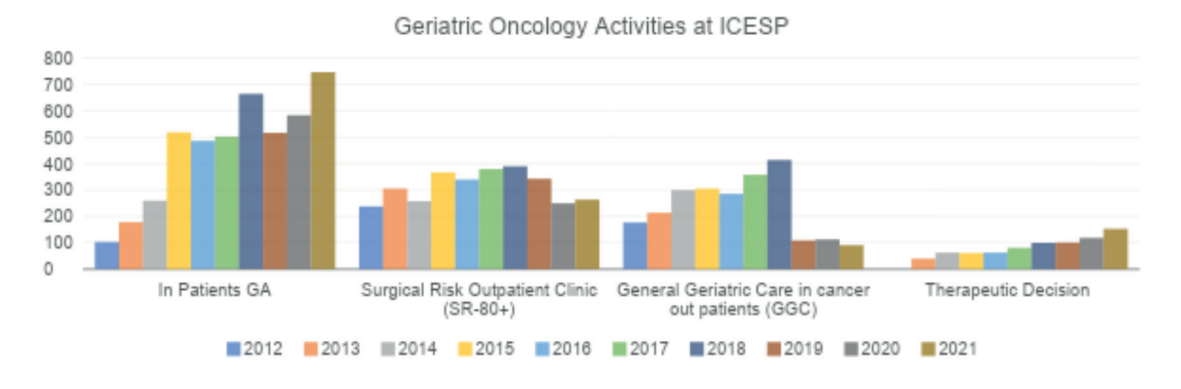
Figure 2. Number of consultations performed by the geriatric oncology clinic per year from 2012 to 2021.