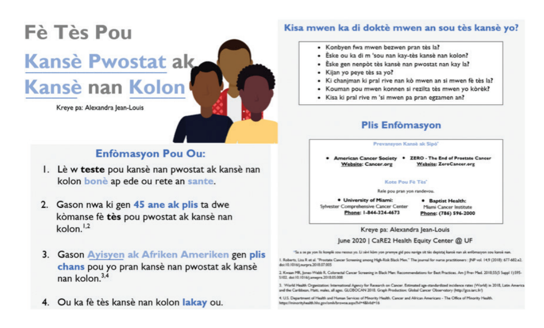
Figure 1. The resource guide displayed in English and Haitian-Creole after the completion of the online survey.

<u>Survey distribution</u>: The distribution of the survey occurred exclusively online. The survey was self-administered and completed electronically using Qualtrics.