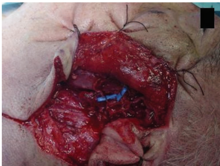
Figure 3: Operative view: left parotidectomy

A recent study [6] summarizing new findings on salivary gland pathology has included the morphological spectrum of epithelial-myoeplithelial carcinoma and variants.