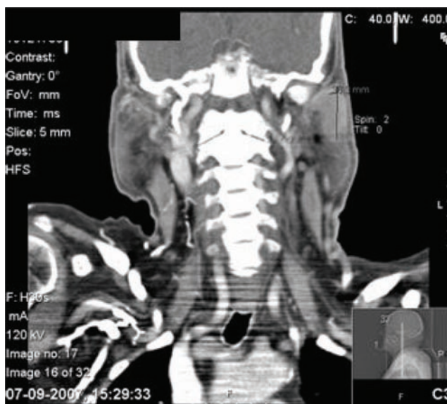
Figure 1: Cervical TC scan