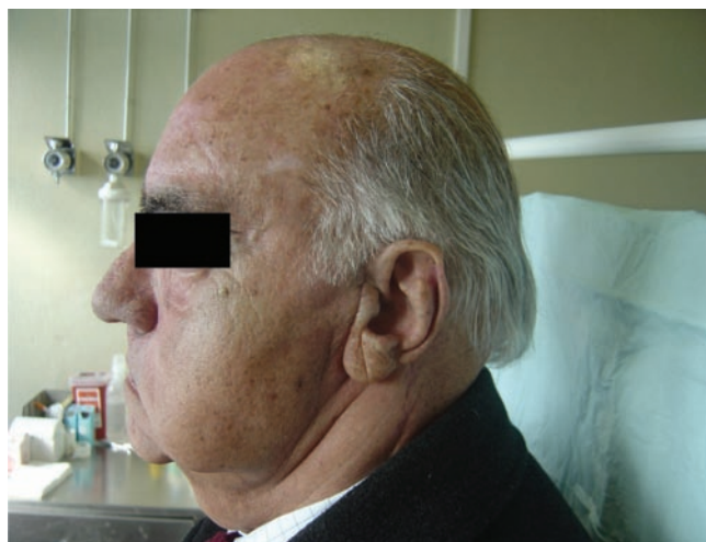
Figure 5: Results after 1 year

neoplasm (SMN) to organs rarely susceptible to metastasis, such as the parotid gland, may occur even in patients not given radiotherapy to the head and neck region [11,12].