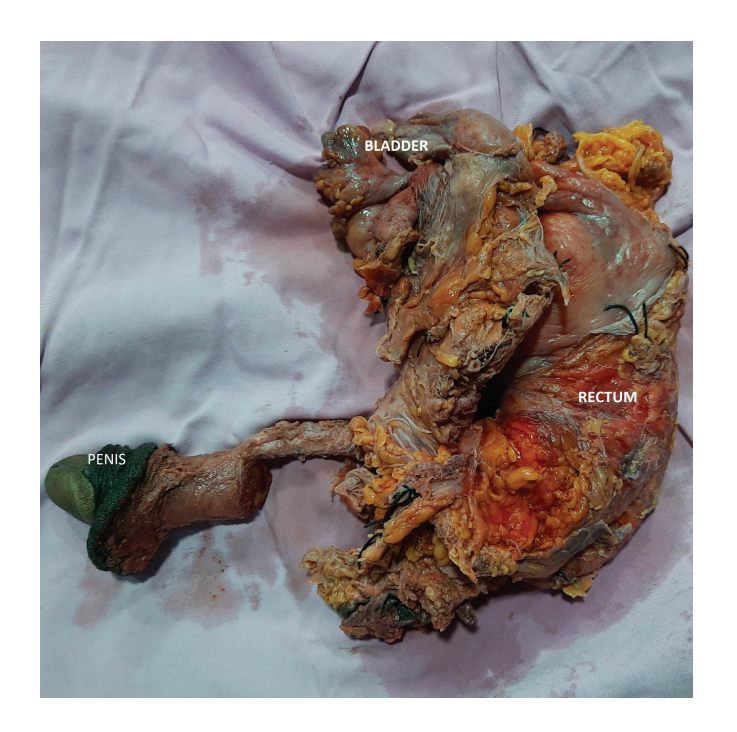
Figure 4. High-power view showing the typical signet ring cells (arrows) with nucleus pushed to the periphery by abundant intracellular mucin (Eosin and Hematoxylin stain, magnification 100×).