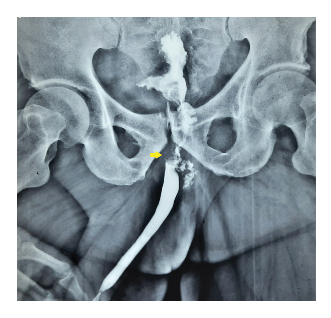
Figure \ 1. \ Ascending \ ure throgram \ showing \ the \ irregular \ filling \ defect \ at \ the \ level \ of \ bulbo-membranous \ junction.